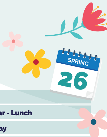
Zoe Westley HEADTEACHER